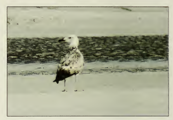
Heuglin's Gull Larus ( argentatus ) heuglini , Mahé, February 1992 (Adrian Skerrett)

while both these species had occurred in Seychelles, the vast majority of sightings could not be assigned to one species or the other. SBRC has reclassified Lesser Black-backed Gull as a vagrant.